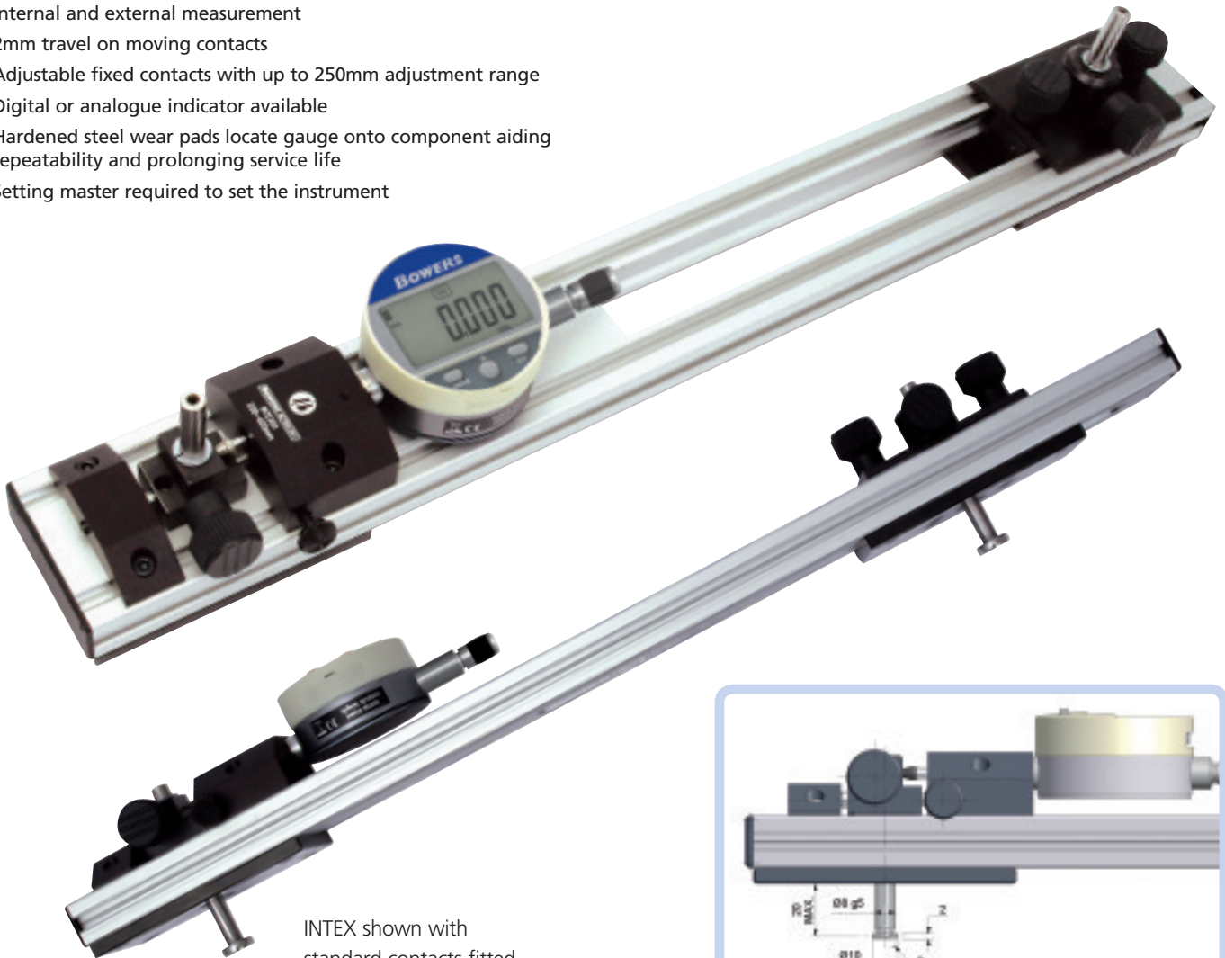
INTEX shown with standard contacts fitted (available as extras)